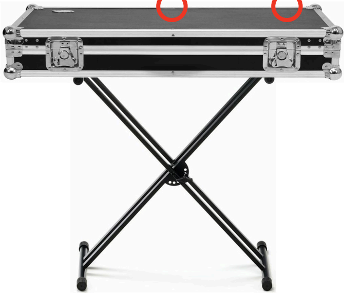
keyboard stand + flat flight case