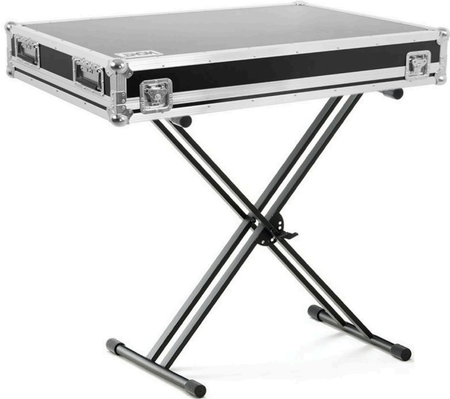
keyboard stand + flat flight case